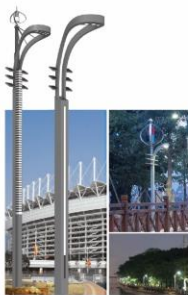
广州亚运会海心沙主题 灯具设计 10~15米风光互补道路灯 10~15M Wind-Solar Conversion Roadway Lamp

从体育馆主馆造型中提取框架线条，并融入“羊”城的造型元素，打造出简洁时尚，极具科技感的照明产品。钣金折弯焊接成型，灯杆为标准矩形杆，太阳能板定制成型，风机为标准配置。